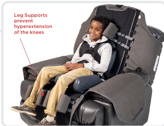
Shown with optional seat & back liners